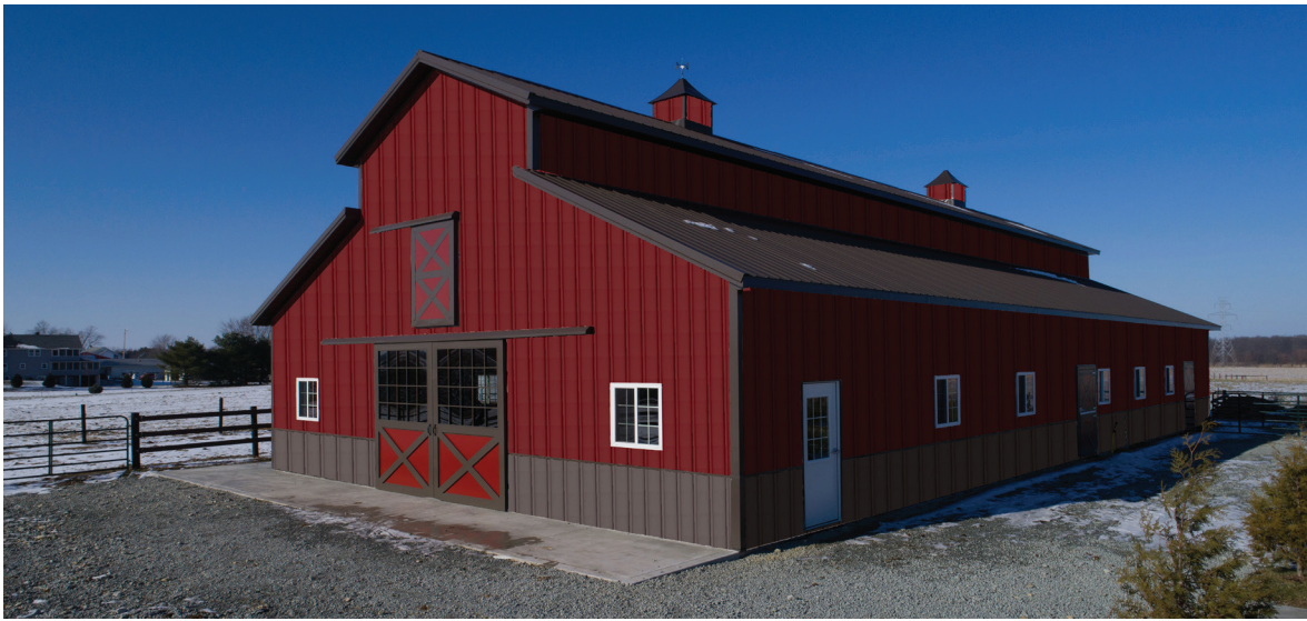
Rustic Red Board & Batten metal panels